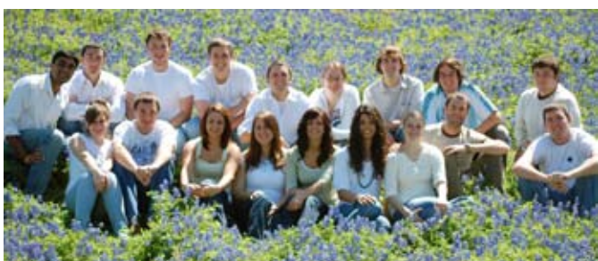
A student home group at Texas A&M

It is not just this team but the church as a whole that has been mobilized into mission. More than 15% of church members participated in short term missions or summer Leadership