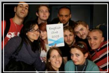
English Club in Milan

In April 2008 we sent two mission teams to Milan and Genoa to "spy out the land" and discern where God was working. We chose cities within two hours of Torino so that we'd be able to keep