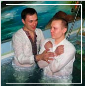
Baptism of one of the men

Now, what is happening in their lives is spreading to two more places. Valeri and his new brothers—nine in all—are helping with community projects in the village. As people watch the transformed lives of the former drug addicts, "good gossip" is spreading in the small town. In addition, some of the men were baptized, and many of their family members attended.